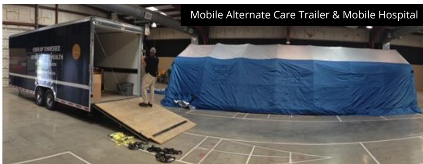
Mobile Alternate Care Trailer & Mobile Hospital