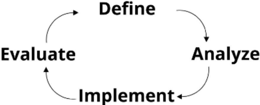
Illustration of the cyclical nature of data-based decision-making